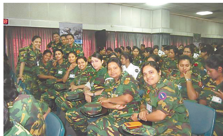
Female officers in Bangladesh army EMBASSY OF BANGLADESH

In conclusion, I would like to extend my best wishes to the people of Bangladesh for their health and prosperity.