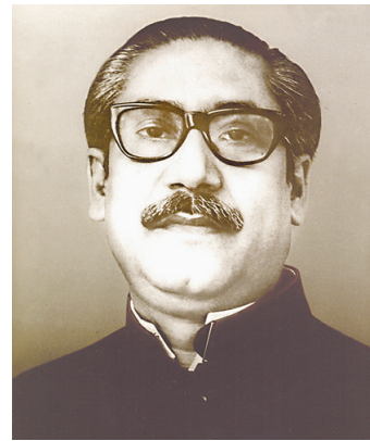
Father of the Nation Bangabandhu Sheikh Mujibur Rahman

The people of our country are democratic and peace loving. They do not support violence including militancy and terrorism. We should keep in mind that the overall development of the country would not be attained without functioning and institutionalizing democracy. Continuous practice for democratic norms and values, maintaining tolerance and fortitude and showing mutual respect are the preconditions for thriving democracy. Therefore, we have to maintain patience, self-restraint, forbearance along with showing respect to others' opinion in a democratic pluralism. Let us make our Jatiya Sangsad (Parliament) a centre of discussion to resolve all national issues. I am confident that everyone would play one's responsible role from respective position in fulfilling the desired goals of independence and hopes and aspirations