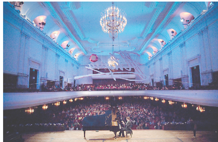
Held every five years since 1955, the 17th International Fryderyk Chopin Piano Competition is taking place in Warsaw this year. The main competition and concerts will be held from Oct. 21 to 23.