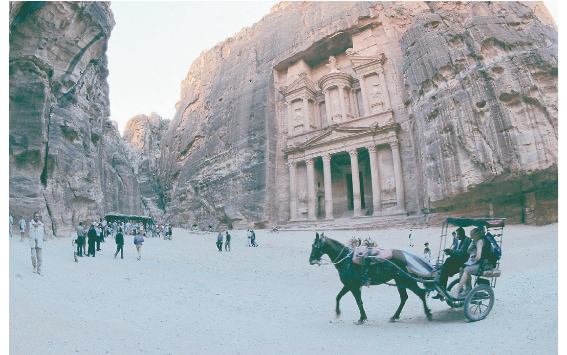
The historic city of Petra is a UNESCO World Heritage site and Jordan's leading tourist attraction.

Jordan is blessed with the gift of stability and security despite what the region is witnessing these days. This was possible through the strong leadership and wisdom of His Majesty King Abdullah II, along with the unwavering vigilance, and determination of our people to never allow extremism to touch their country, or the lives they built for their families, keeping Jordan a moderate and tolerant society where human rights and dignity are safeguarded, and where doors are open to millions of refugees who found in Jordan a safe haven for themselves and their loved ones.