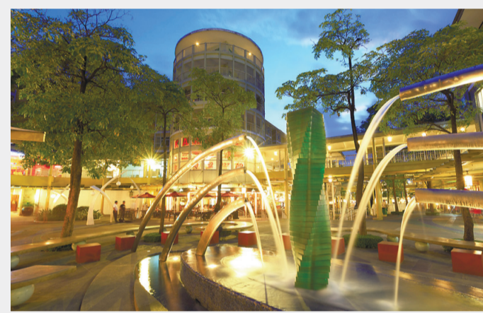
Bonifacio Global City, a former military base and now popularly known as The Fort, has become a new center of urban development, business and lifestyle in Metro Manila.