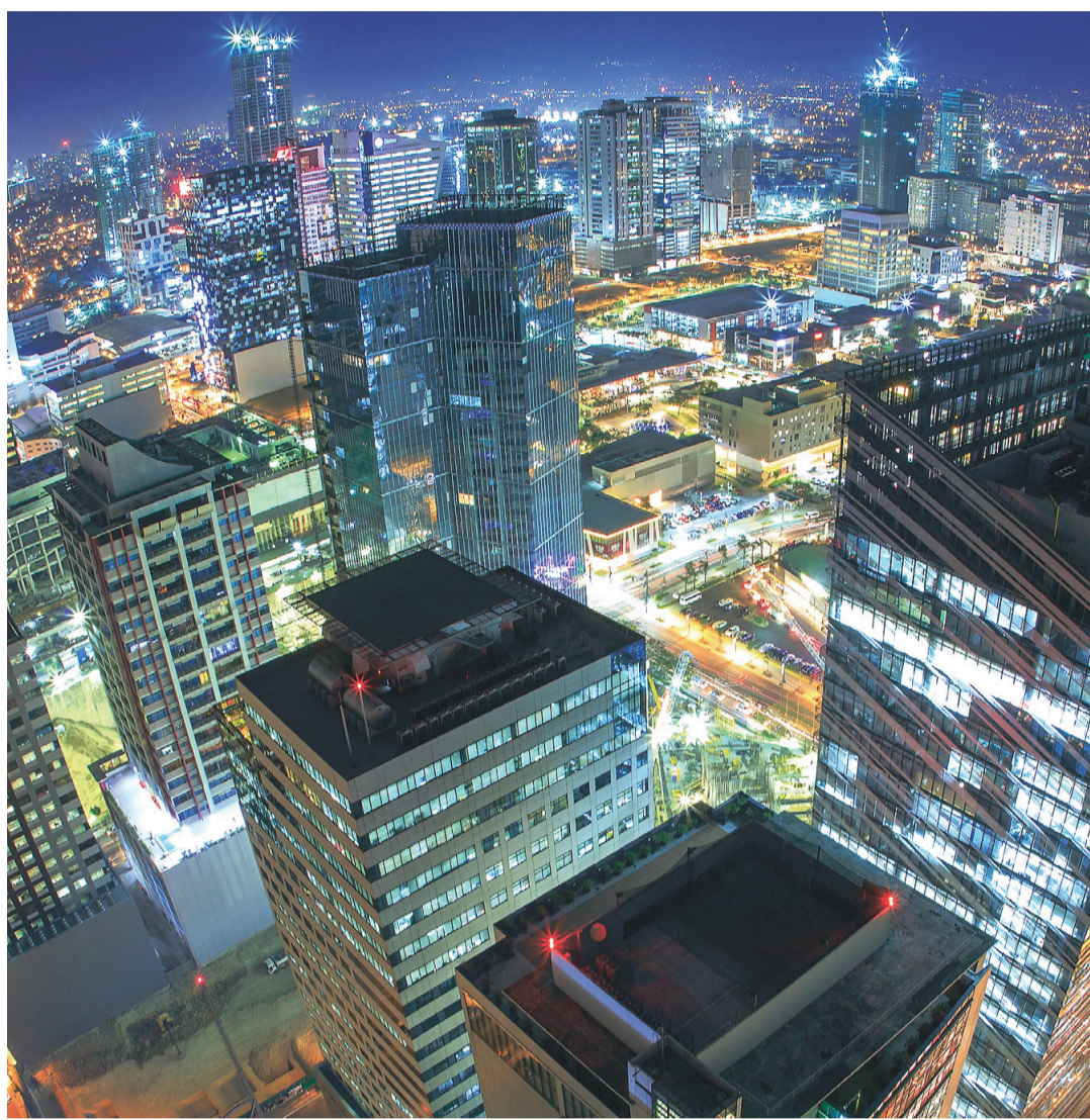
A night view of Makati City, Metro Manila, which has the highest concentration of multinational and domestic corporations in the Philippines.

The Philippines' notable gross domestic product growth rates in recent years are largely ascribed to President Aquino's administration's commitment