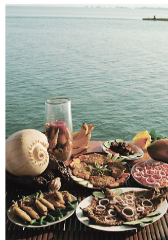
Clockwise from above: The Chocolate Hills on Bohol Island; Spanish colonial architecture in the historic town of Vigan; the Banaue Rice Terraces in the mountains of Banaue; and the diverse variety of cuisine highlighting delicacies from each region are just some of the tourist attractions in the Philippines.