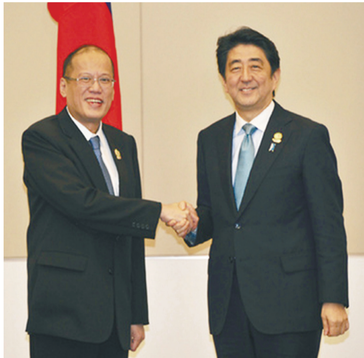
Philippine President Benigno S. Aquino III and Prime Minister Shinzo Abe meet on Nov. 12, on the sidelines of ASEAN-related Summit Meetings in Myanmar.