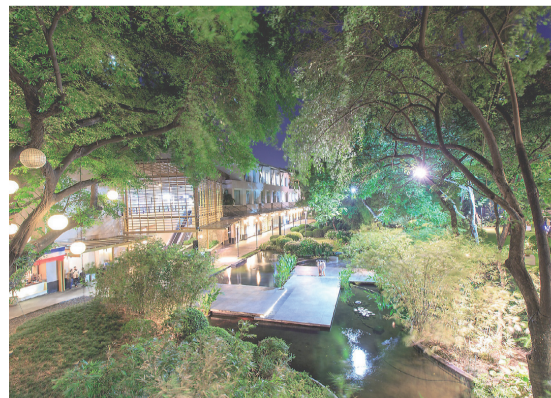
Located within the Makati's business district in Metro Manila, the Greenbelt shopping mall offers a mix of high-end retail shops, restaurants, leisure and entertainment.

Once again, we would like to extend a very warm welcome to President Aquino.