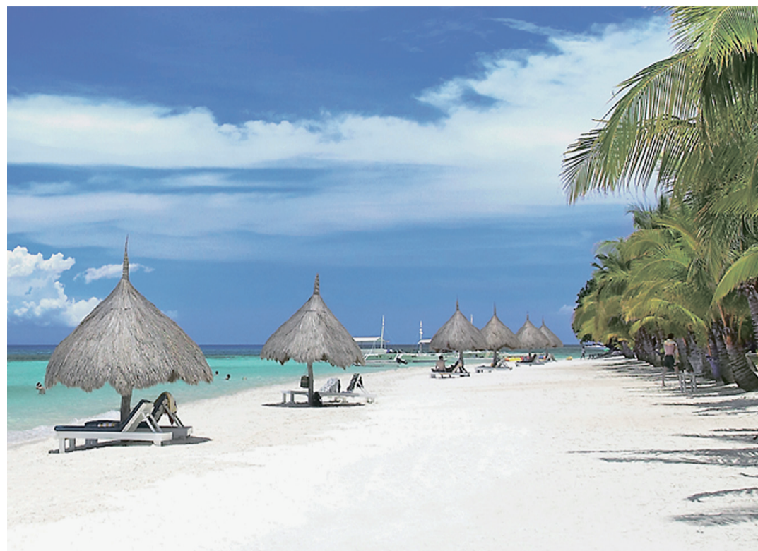
The white sand beaches and resorts on the islands of Boracay (left) and Bohol (right) are among the Philippines' major tourist draws.