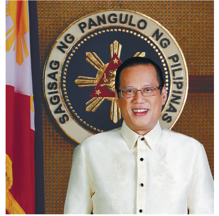
President Benigno S. Aquino III of the Republic of the Philippines

With the bilateral relationship set to mark 60 years of relations in 2016, President Aquino's visit serves as a most auspicious occasion for yet again demonstrating the abiding relevance of Philippine-Japan relations, in serving the best interests of the Filipino and Japanese peoples, and in contributing to the stability and future growth of the larger region that is our common neighborhood.