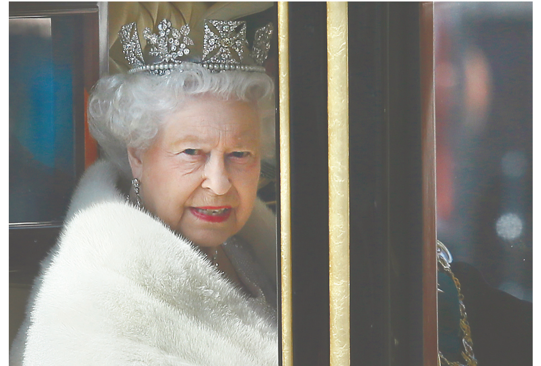
Her Majesty Queen Elizabeth II travels in a carriage from Buckingham Palace toward the Houses of Parliament in London on May 27 to deliver a speech to open Britain's Parliament after the new Conservative government was elected.

But we can harness those strengths even more working with our top partners. Japan is the second biggest contributor of foreign direct investment into the United Kingdom. It has also generated many great business ideas and technologies, and has great strength in sophisticated manufacturing. And Japan is now seeking collaboration in the open innovation context. When the U.K. and Japan work together, we are world leaders. Publications of our joint research are cited 2.5 times more than the global average. We are part of each other's success. More cars are produced at Sunderland's Nis-