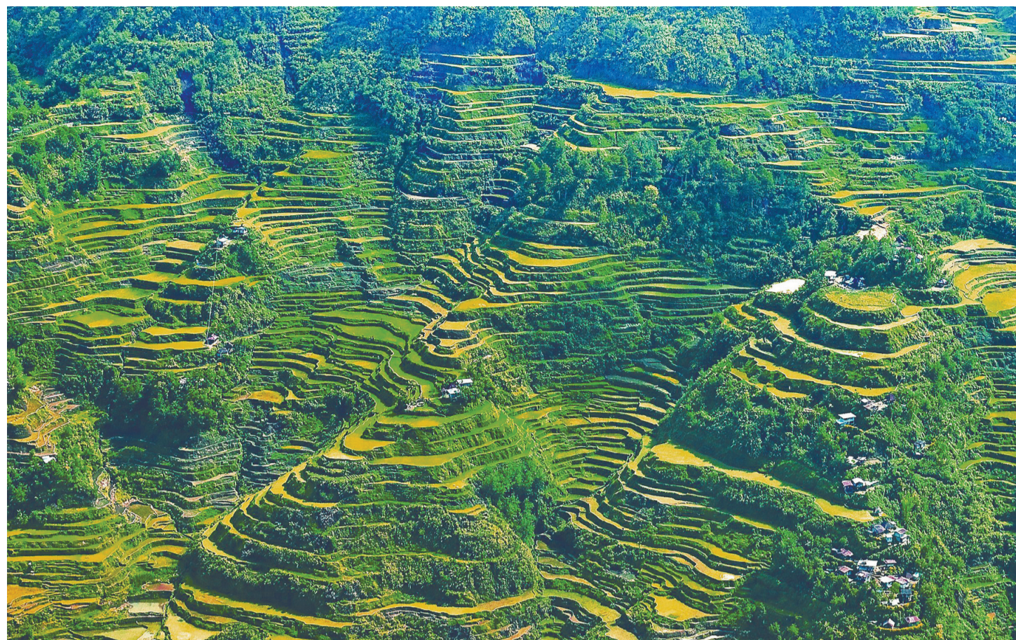
The rice terraces in the mountains of Banaue are designated as a UNESCO World Heritage site. EMBASSY OF THE PHILIPPINES