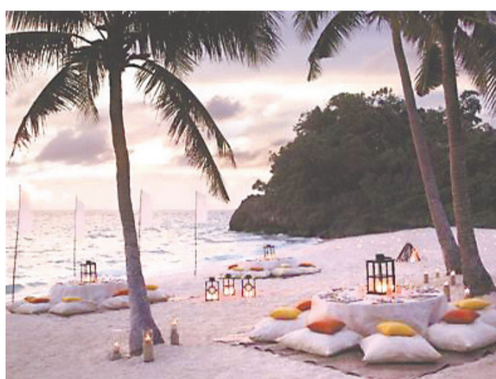
White sand beaches and resorts are among the Philippines' major tourist draws.

In commemoration of VPY 2015, DOT has increased the momentum of their promotional activities over previous years. DOT started 2015 with a bang with train advertisements on Metro Lines and JR East Japan Lines. This was followed by the country's participation