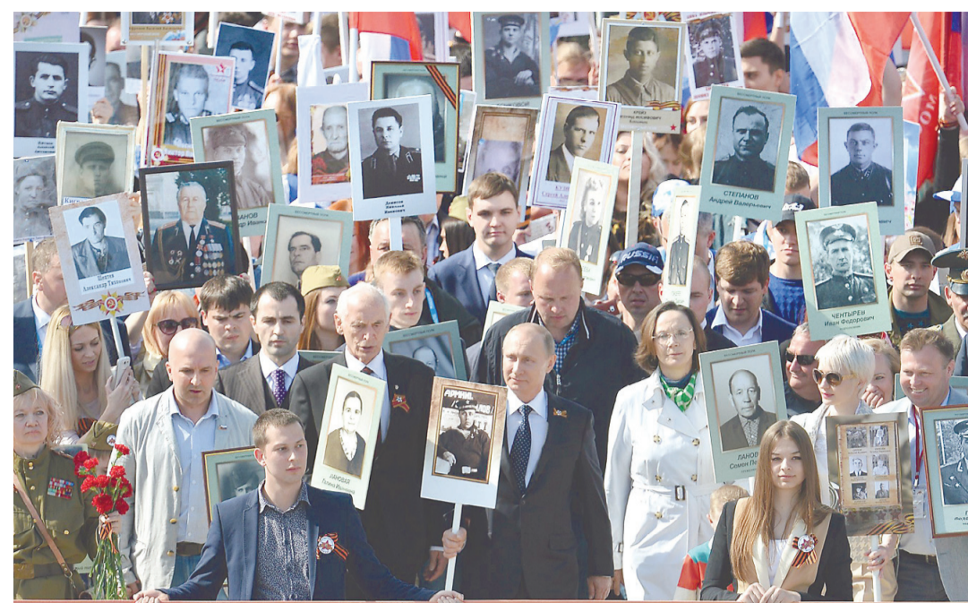
Over 500,000 Russians and foreigners marched in central Moscow on May 9 in commemoration of those who perished and survived World War II during an event called "March of the Immortal Regiment," which was led by Russian President Vladimir Putin (center).

The future of our country is inextricably linked with the Asia Pacific region. Our foreign policy in the Asia Pacific proceeds from the recognition of the crucial importance of creating a modern configuration of interstate relations in the region corresponding to current-day realities. Such a system must simultaneously provide broad opportunities for the promotion of multilateral trade, economic and investment cooperation, resolution of existing multidimensional security challeng-