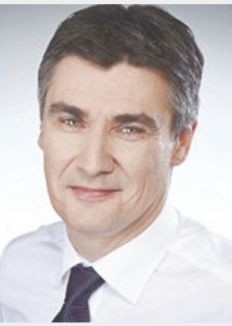
Today, Milanovic runs the center-left coalition government, formed after

Zoran Milanovic is the youngest (born in 1966) Croatian prime minister since the country gained its independence 25 years ago. He began his career in the Ministry of Foreign Affairs, and his political ascent started in 2007 when he was elected president of the Social Democratic Party, then in opposition. He became the new face of Croatian politics, and his arrival marked a generational shift on the Croatian political scene.