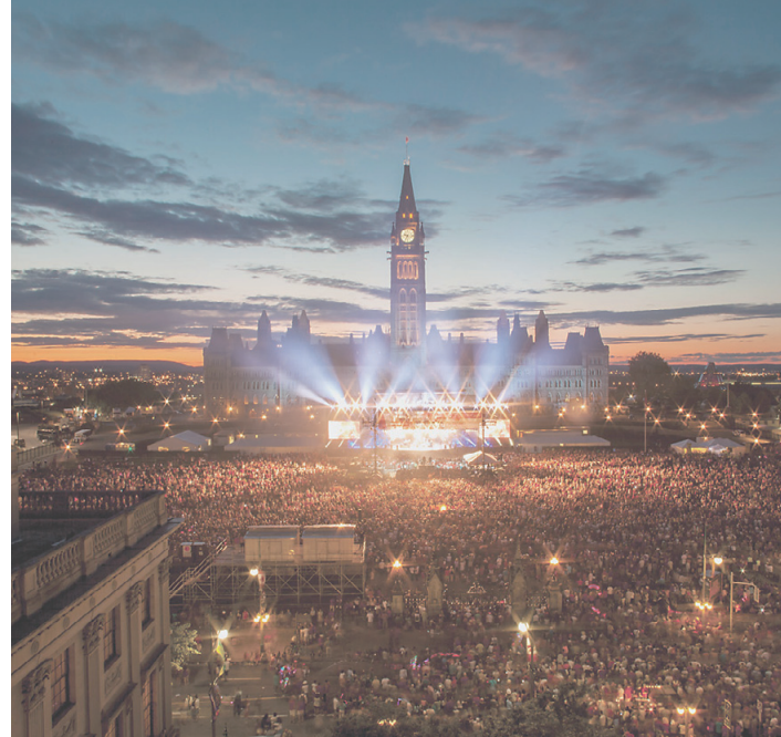
Canadians gather under the night sky to celebrate a past Canada Day in Ottawa on July 1. Canada is hosting the FIFA Women's World Cup this year as part of its "Year of Sport in Canada."

Investment has been another driving force in our growing economic relationship, supported by the more than 330 Japanese businesses in Canada and over 100 Canadian enter-