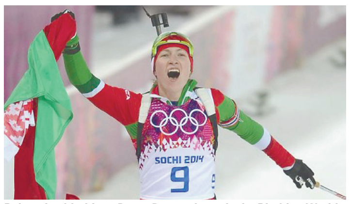
Belarusian biathlete, Darya Dmoracheva, is the Biathlon World Cup overall winner and the best female athlete in European sports for 2014.

This year is special from the point of view of Belarusian history — as it's the 70th anniver-