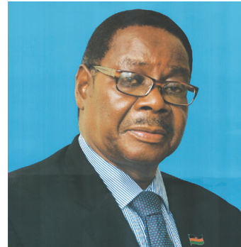
H.E. President Arthur Peter Mutharika of the Republic of Malawi

Malawi, which is one of the most peaceful countries in Africa, is grateful to its cooperating partners, particularly Japan, for increasing development assistance in various sectors. For instance, Malawi remains the country with the largest number of Japanese volunteers — working in areas such as education and health, among others. This year also saw the highest amount of Japanese official development aid and technical assistance to Malawi since formal relations were established in 1964. Currently, the government of Japan is assisting Malawi in the construction of modern roads, electricity expansion, construction of sec-