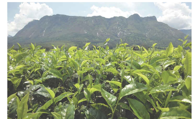
Left: Malawi is home to elephants. Right: Mount Mulanje is a large monadnock in southern Malawi.