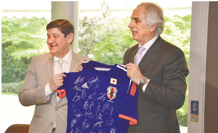
French Minister of Urban Affairs, Youth and Sport, Patrick Kanner (left) meets Vahid Halilhodzic, head coach of the Japanese national football team, during his visit to Japan in April. Bosnian-born French citizen Halilhodzic’s football career includes spells playing for and managing French clubs.