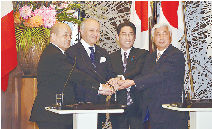
From left, French Defense Minister Jean-Yves Le Drian, French Foreign Minister Laurent Fabius, Foreign Minister Fumio Kishida and Defense Minister Gen Nakatani at bilateral “two-plus-two” talks on security in March in Tokyo