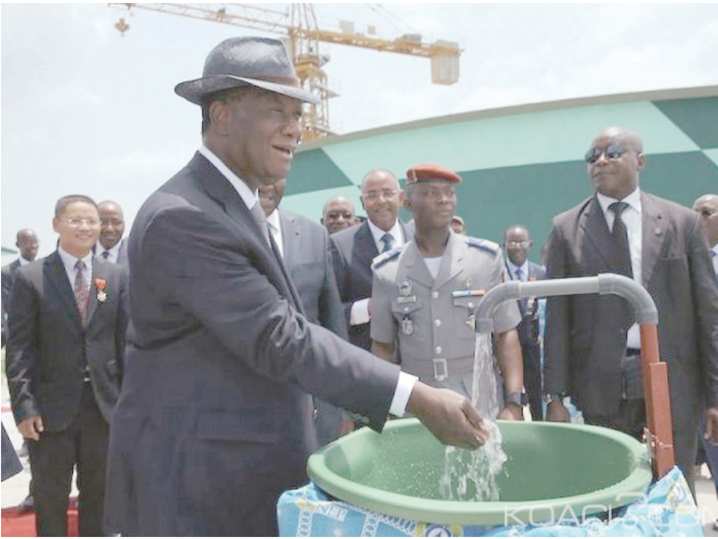
H.E. Mr. President Alassane Ouattara inaugurates a drinking water plant in Bonoua, in the South of Côte d'Ivoire.

world's largest producer. The government also continues to improve public finances by streamlining public expenditures and optimizing revenues. To strengthen good governance, the government has adopted a Public Finance Transparency Code. An illustrative example of this public