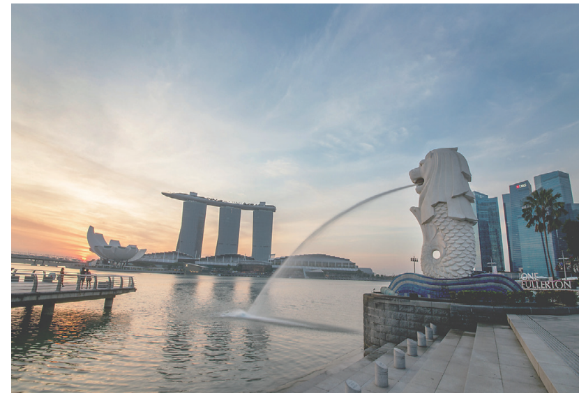
Left: People enjoy a performance in the Singapore Botanical Gardens. Above: The Singapore Merlion overlooks the iconic Marina Bay Sands.

Congratulations to the People of the Republic of Singapore on the 50th Anniversary of Their Independence