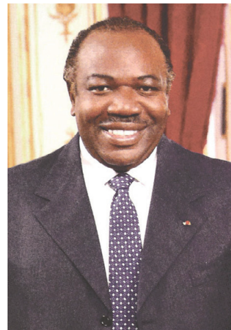
Ali Bongo Ondimba, president of the Gabonese Republic