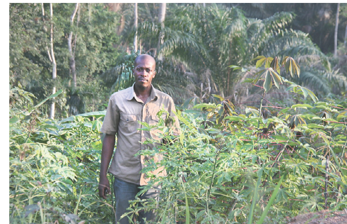
The representative of a local cooperative on a cassava plantation in the village of Adzamikak in Woleu-Ntem Province EMBASSY OF GABON

Deployed in all provinces of Gabon, the program encourages the creation of a large number of jobs, harmonious socioeconomic development