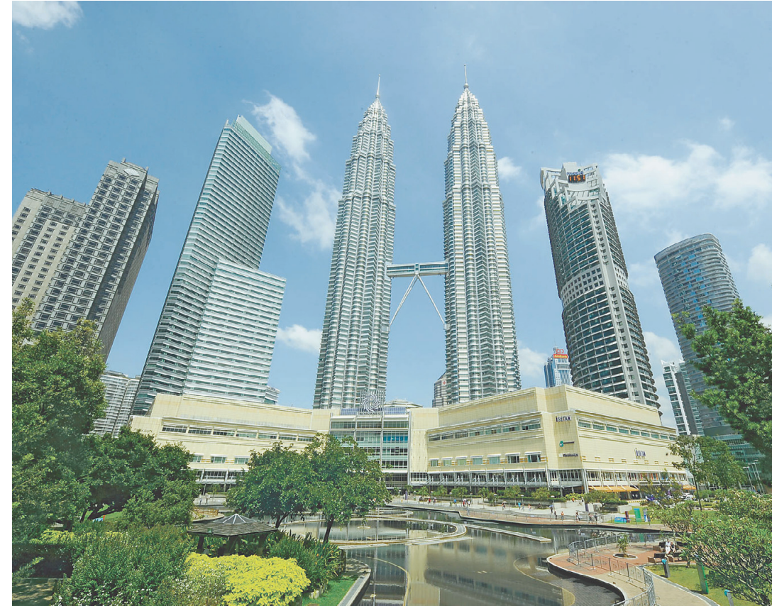
The Petronas Twin Towers and other skyscrapers in Kuala Lumpur, the capital city of Malaysia and one of the most vibrant cities in Southeast Asia.

with the Japanese government, parliamentarians, industry players, academia and other institutions to further advance our friendship and cooperation for the mutual benefit of our countries.