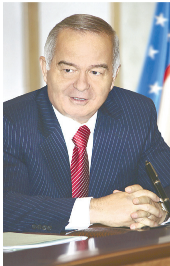
President of the Republic of Uzbekistan H.E. Islam Karimov

In turn, steady investment flow into Uzbekistan's industrial sector, creating entirely