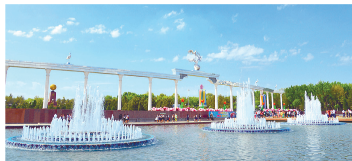
Independence Square in the center of Tashkent is a favorite recreation spot for residents.

A solid foundation of historical and cultural ties, as well as strong potential for economic and political cooperation will further serve to deepen the Uzbek-Japanese strategic partnership.