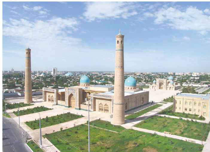
An ancient religious square, the Hasti Imam complex in the capital Tashkent has been an important center of Islamic culture in Uzbekistan for over a thousand years.

Today, with the passing of time, we are convinced again of the correctness of the well-thought-out strategy of demo-