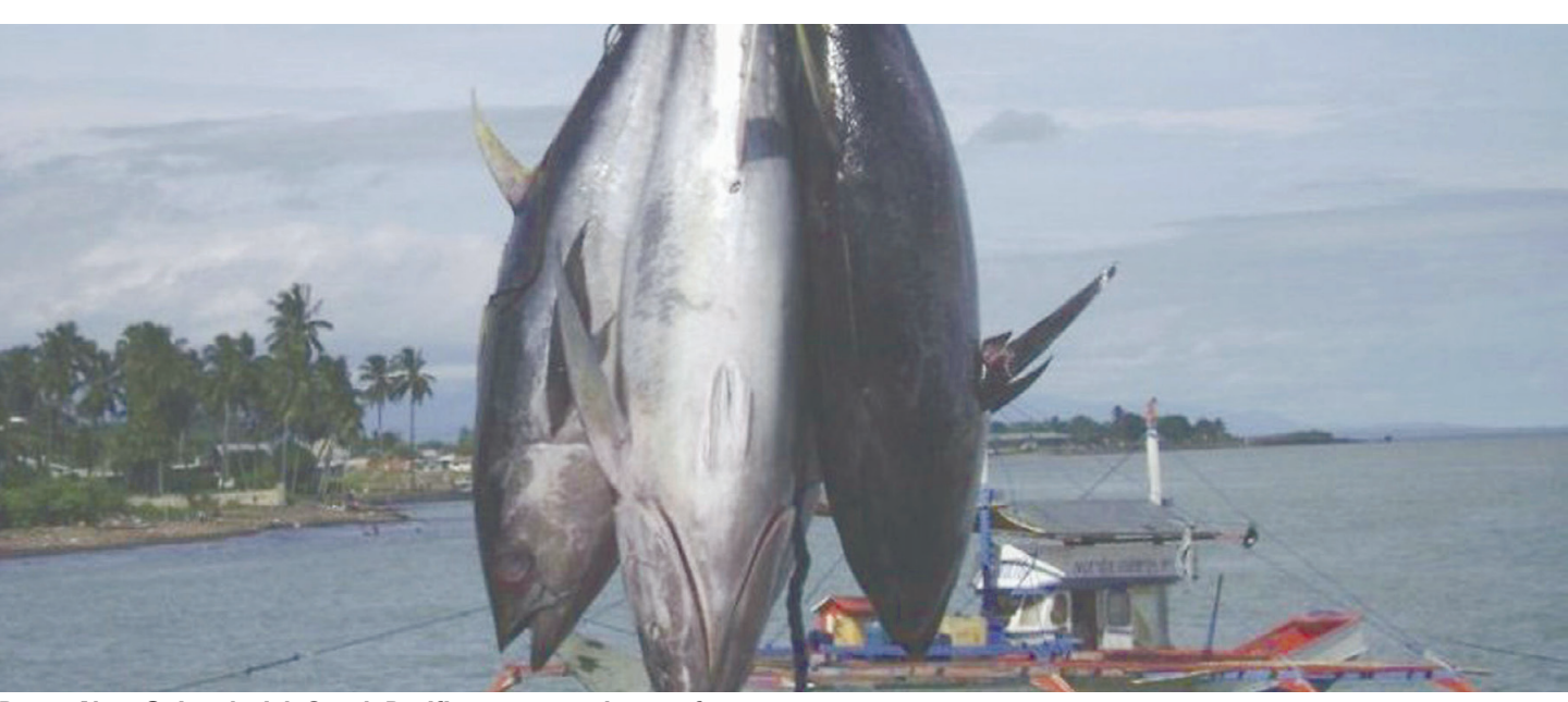
Papua New Guinea's rich South Pacific waters are known for tuna.