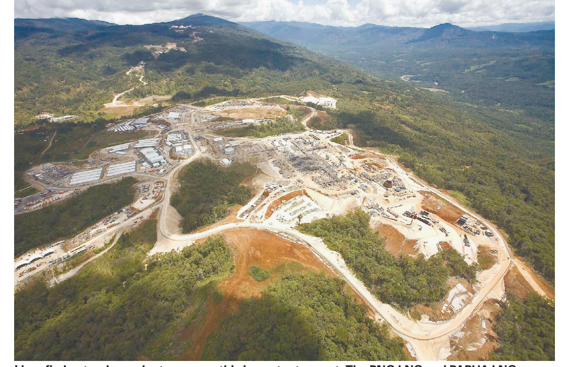
Liquefied natural gas plants process this important export. The PNG LNG and PAPUA LNG are ongoing projects in this area.

Finally, I extend my most sincere appreciation and gratitude to The Japan Times and our sponsors on these pages.