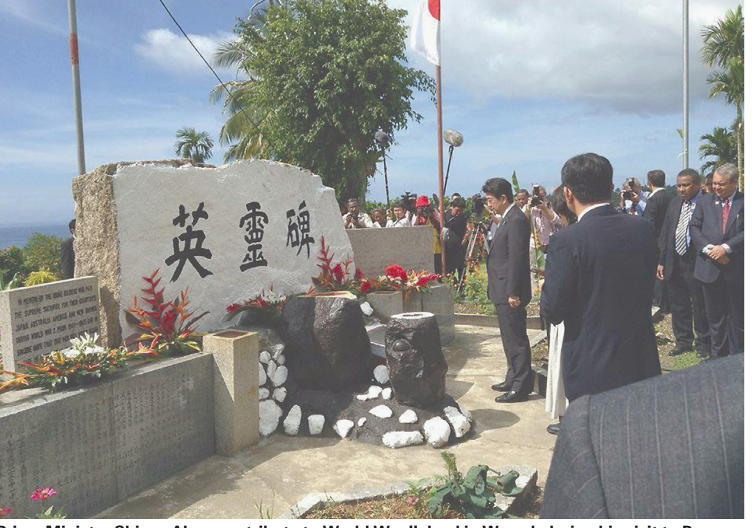
Prime Minister Shinzo Abe pays tribute to World War II dead in Wewak during his visit to Papua New Guinea in July 2014. EMBASSY OF PAPUA NEW GUINEA

O Neill led a strong delegation of ministers, governors and parliamentarians to Japan in June 2014. He met with CEOs of relevant Japanese corporations to discuss ongoing and new projects and projects for them in PNG.