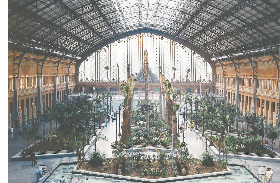
Inaugurated in 1851, Madrid Atocha is the largest railway station in Madrid. In 1992, the old station building was converted into a concourse with shops, cafes, chic clubs and a verdant tropical garden.

common interests. We will also continue promoting Spain's culture and heritage in Japan through a rich cultural program developed by Instituto Cervantes in Tokyo with the presentation in