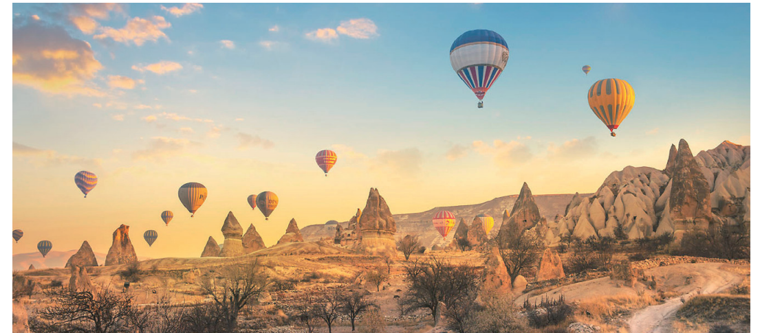
Ballooning is a popular activity to get a bird's-eye view of the fairy tale-like landscape of Cappadocia.

Today, Turkey and Japan enjoy strong and friendly relations in all fields. We share similar ideals, common values and like-minded approaches toward global issues. The strategic partnership between our countries has been further consolidated by our President H.E. Recep Tayyip Erdogan's recent visit to Japan on Oct. 7 and 8. Turkey is willing to engage Japan in her 2023 Vision that envisages a population of 80