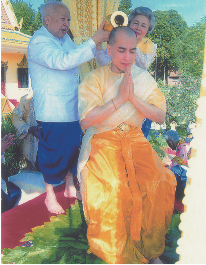
The Late King Father Norodom Sihanouk and Queen Mother Norodom Monineath anoint King Norodom Sihamoni's head with nine jars of holy water, in a symbolic gesture to bless his reign during his coronation ceremony on Oct. 29, 2004.

For Cambodia, Japan has always been a great friend. All Cambodians know that Japan has assumed a meaningful role in bringing peace and development to the kingdom. Since the signing of the Paris Peace Agreements on Cambodia in October 1991, Japan has continued to mobilize assistance to rehabilitate and help reconstruct our national economy