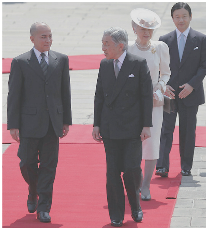
Left; His Majesty King Norodom Sihamoni is welcomed by Their Majesties Emperor Akihito and Empress Michiko, and Crown Prince Naruhito on May 17, 2010, during a state visit to Japan to strengthen the bilateral relationship between the two countries. Right top; Cambodia's new King Norodom Sihamoni delivers a speech at a solemn coronation ceremony held in the Throne Room of the Royal Palace in Phnom Penh on Oct. 29, 2004. Right bottom; Tsubasa Bridge was inaugurated on April 6. EMBASSY OF CAMBODIA