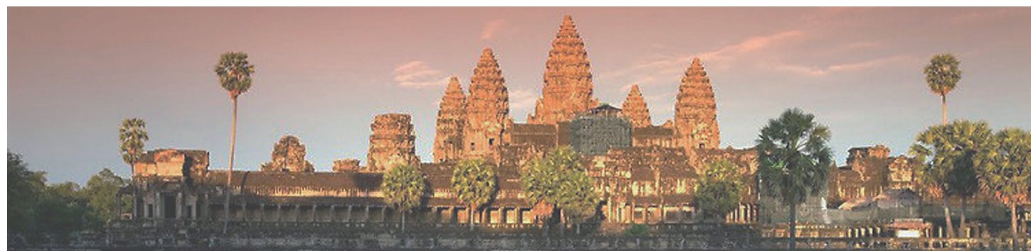
Angkor Wat Temple EMBASSY OF CAMBODIA