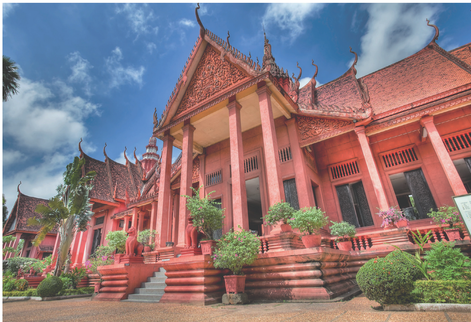
The National Museum of Cambodia in Phnom Penh, the country's leading historical and archaeological museum, was officially inaugurated by King Sisowath in 1920.