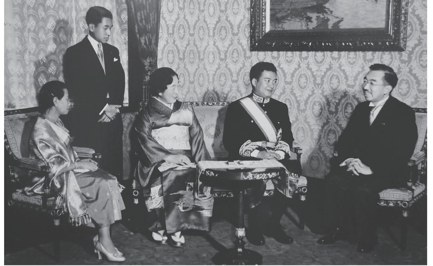
Prince Norodom Sihanouk meets Emperor Hirohito (right), then-Empress Nagako (third from right) and then-Crown Prince Akihito (second from left) during his visit to Japan in December 1955.

In essence, the strategic partnership between Cambodia and Japan has created a new milestone in Cambodia-Japan