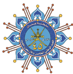
Official logo for the 45th National Day of the Sultanate of Oman OMANI EMBASSY

tive reflections go back to 1970 when H.M. Sultan Qaboos assumed the reins of power. Through his wise and compassionate leadership, H.M. Sultan Qaboos rallied his people toward a common goal of nation building and peaceful cooperative coexistence. The Omani people have much to be proud of, from education and healthcare to infrastructure and industrial development, the sultanate has made extraordinary strides in all aspects of nationhood, as well as expanding its friendly relations with the countries and peoples of the world.