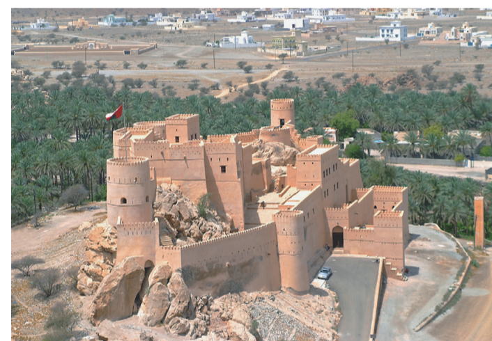
Nakhla Fort in the northwest part of the sultanate is a popular tourist destination.

In closing, I would like to express my heartfelt appreciation and sincere thanks and gratitude to the people of Japan for their kindness and hospitality. I would also like to thank The Japan Times for giving me this opportunity to write about Oman and the friendship between Oman and Japan and to express my embassy's warm greetings and appreciation to our many friends in Japan for their support and assistance in promoting the good relations between our two friendly peoples. I am also indebted to our sponsors, whose generosity has made this supplement possible. I am confident that our relations in the coming days will see the further enhancement of close bonds of friendship between Oman and Japan.