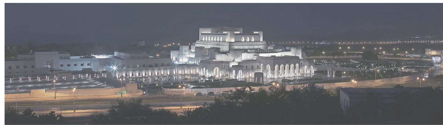
The Royal Opera House Muscat is the leading venue of arts and culture in the Sultanate of Oman.

Congratulations to the People of the Sultanate of Oman on the Occasion of the 45th Anniversary of Their National Day