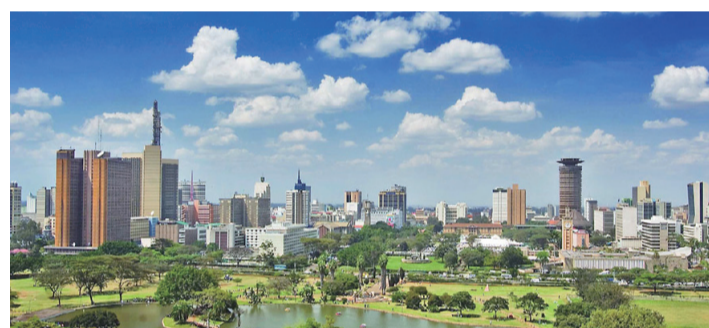
A business and diplomatic hub of Eastern and Central Africa, Nairobi will host the sixth Tokyo International Conference on African Development (TICAD VI) in 2016.

Finally, the embassy wishes to sincerely thank all partners who have supported us to host the National Day reception this year. We wish readers of The Japan Times a happy festive season and good health and prosperity in the New Year. For more information about Kenya, visit our website at www.kenyarep-jp.com .