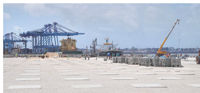
Expansion of the Port of Mombasa is one of the flagship projects under Kenya's "Vision 2030" development blueprint. JICA

Congratulations to the People of the Republic of Kenya on the 52nd Anniversary of Their Independence