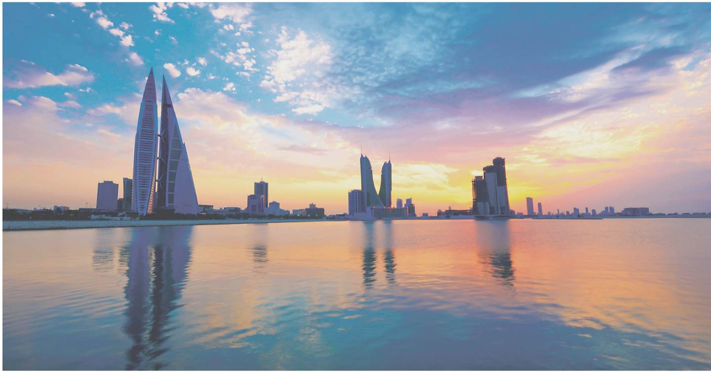
Bahrain skyline EMBASSY OF BAHRAIN

To conclude my remarks, I wish the best of ongoing prosperity and happiness to Their Imperial Majesties Emperor Akihito and Empress Michiko, as well as the country of Japan and its people, the steady progress in all fields for both countries and the continuance of the special relationship uniting both nations.