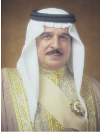
His Majesty King Hamad bin Isa Al Khalifa of Bahrain

On this occasion, the Embassy of the Kingdom of Bahrain in Tokyo has the honor to renew, on behalf of the government and people of Bahrain, its heartfelt greetings and good wishes to Their Imperial Majesties Emperor Akihito and Empress Michiko,