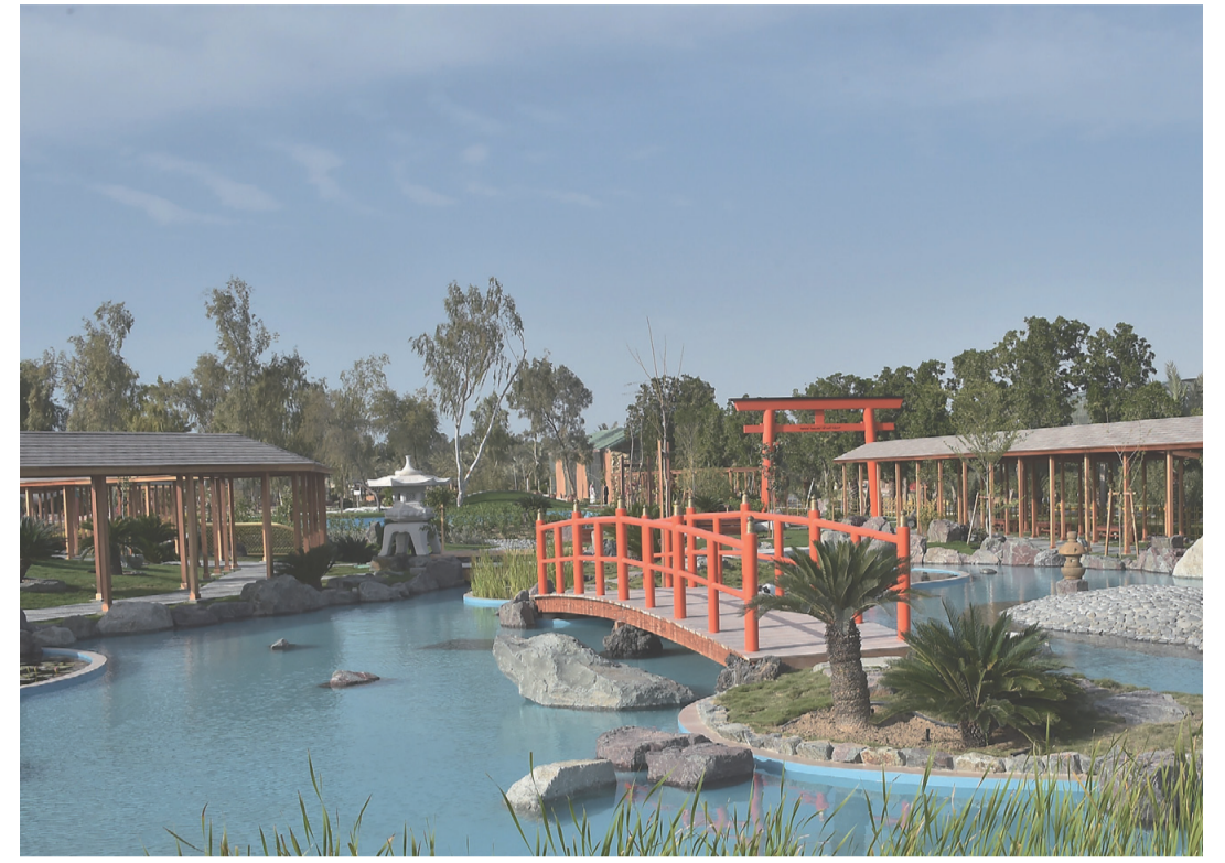
Japanese garden in Bahrain EMBASSY OF BAHRAIN

The Kingdom of Bahrain, with the democratic reforms of H.M. King Hamad bin Isa Al Khalifa, the premiership of His Royal Highness Prince Khalifa bin Salman Al Khalifa, and the economic vision of His Royal Highness Prince Salman bin Hamad Al Khalifa, is managing the global challenges of the third millennium by working in harmony and peace with all the nations of the Middle East, the Arab World, Islamic countries and the rest of both the East and