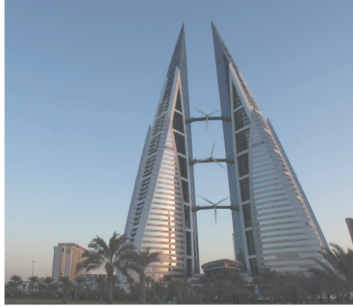
Bahrain World Trade Center EMBASSY OF BAHRAIN

Together with the EDB Japan Office, we serve as the first point of contact for Japanese people exploring business opportunities in Bahrain,