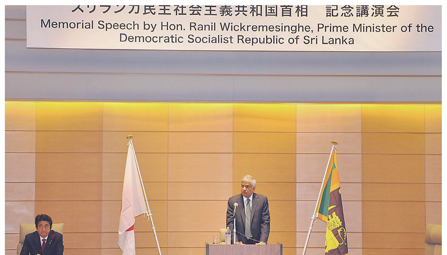
Sri Lankan Prime Minister, the Hon. Rani Wickremesinghe speaks on his official working visit to Japan.

I eagerly look forward with confidence to the enduring friendship between Sri Lanka and Japan, as well as to further strengthening the relationship between our two countries.