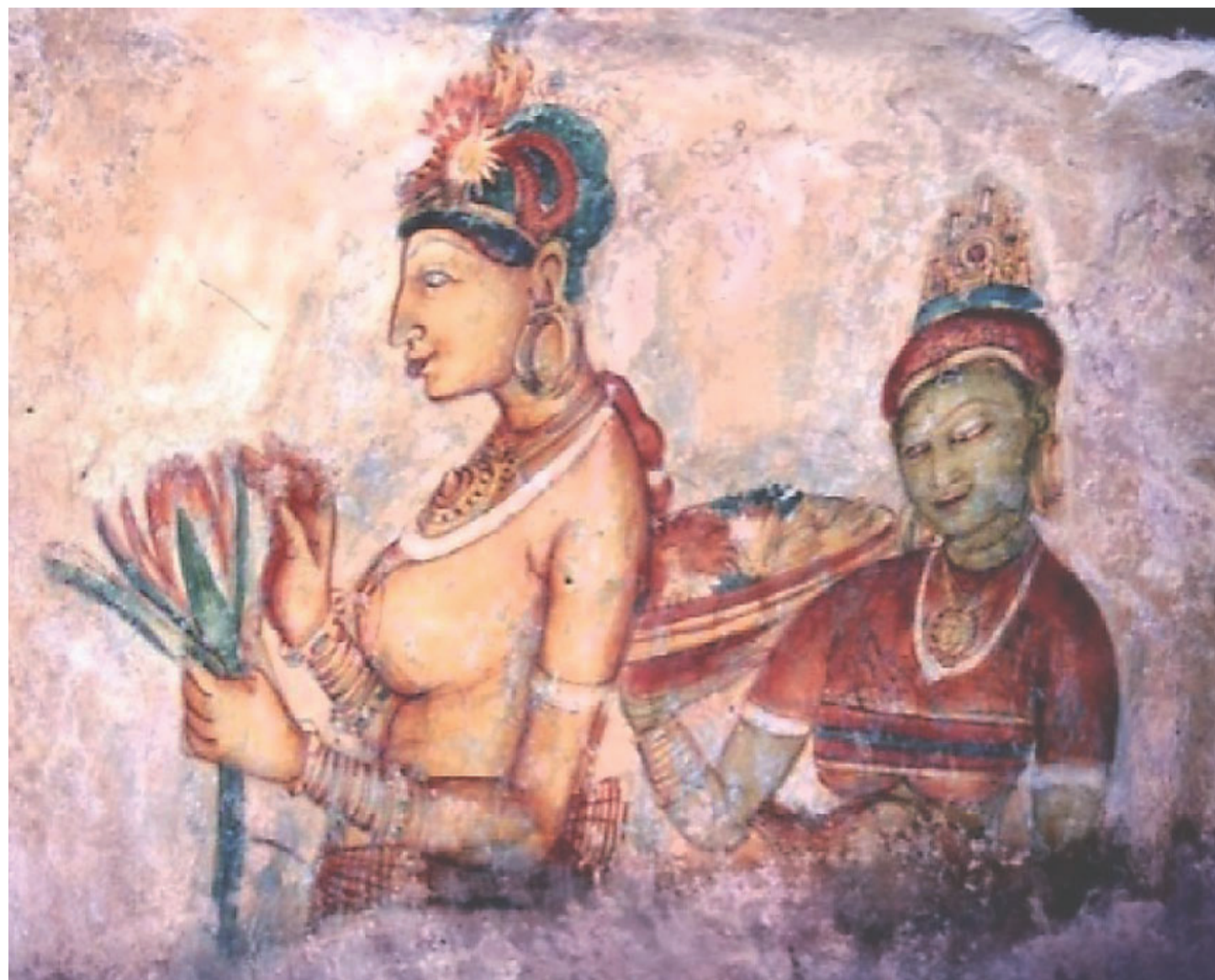
Ancient frescos at the ruins of Sigiriya, a UNESCO World Heritage site, depict women known as the "Sigiriya Ladies."