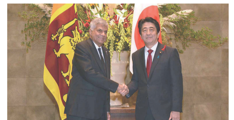
Prime Minister Wickremesinghe meets Japanese Prime Minister Shinzo Abe during his official working visit.

And now, the task before us is to ensure that the hard-won