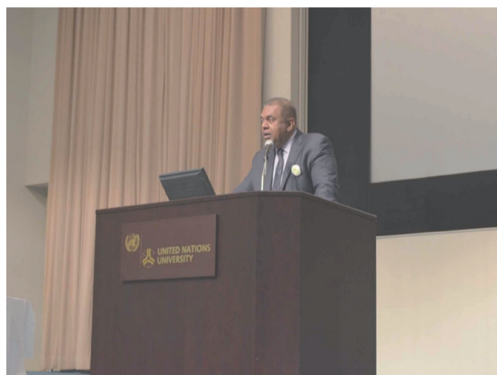
Minister of Foreign Affairs of Sri Lanka, the Hon. Mangala Samaraweera, speaks at the High-Level Seminar on Peacebuilding, National Reconciliation and Democratization in Asia during his official visit to Japan.

We will continue to have a strong, vibrant foreign policy and healthy relationships with