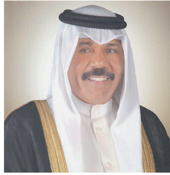
Crown Prince of the State of Kuwait Sheikh Nawaf Al-Ahmad Al-Jaber Al-Sabah

We live in a world of ever-increasing humanitarian challenges and conflicts of an unprecedented scale, especially in the Middle East, that