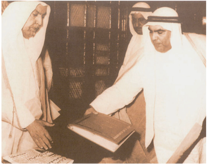
The constitution of the State of Kuwait upholds democracy. EMBASSY OF KUWAIT