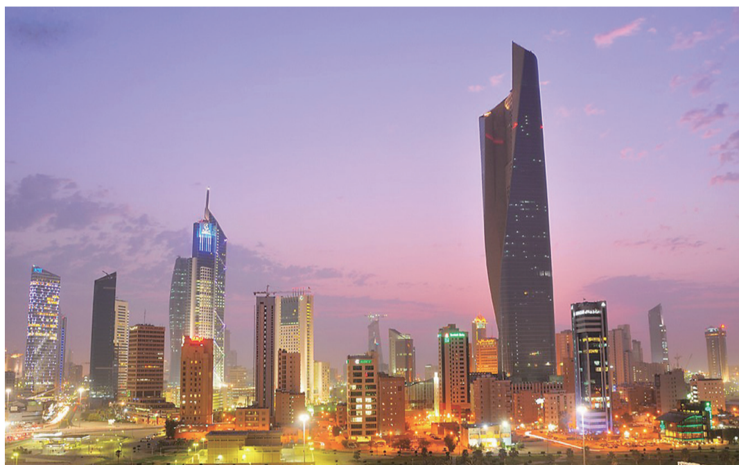
Skyscrapers are one of the major features of Kuwait City.

http://www.idemitsu.com/ 1-1, Marunouchi 3-chome, Chiyoda-ku, Tokyo 100-8321, Japan Tel: +81-3-3213-3180