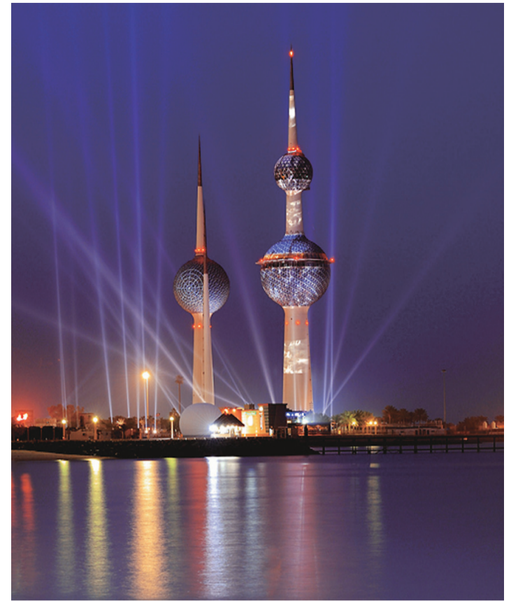
Kuwait Towers with floodlights EMBASSY OF KUWAIT

Economically, the State of Kuwait, as a major oil producer, has been keen on shifting its economy, which currently relies almost entirely on this important commodity, toward a diverse economy with various income resources and economic activities. Kuwait's vision for 2035 that articulates His Highness' aspirations and is endorsed under the current Development Plan, aims to transform Kuwait into a world-class financial and commercial center. This will see the private sector leading economic activities, fostering competitiveness and increasing productivity, supported by vi-