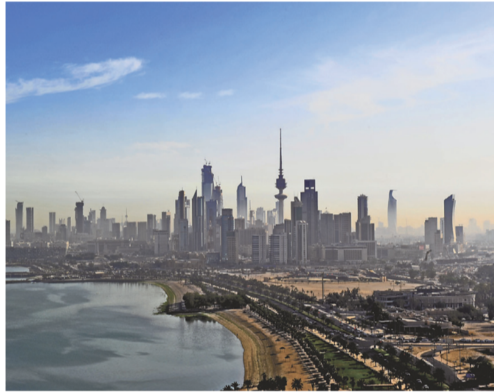
Kuwait City EMBASSY OF KUWAIT