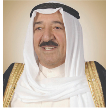
Amir of the State of Kuwait Sheikh Sabah Al-Ahmad Al-Jaber Al-Sabah

have resulted in displacing over millions of refugees around the world. In the face of these tremendous crises, the international community's responsibility to exert more effort toward finding a solution for these struggles is becoming increasingly difficult. Therefore, building on the principle of shared responsibility, every nation is called upon to work out innovative ways to meet the requirements and development needs that would eventually contribute to eradicating poverty by the year 2030 through joint international efforts and active global partnerships.