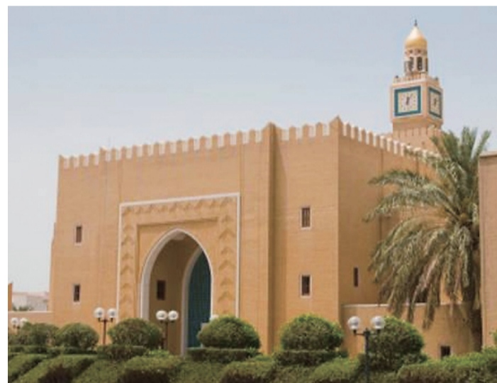
Failaka Island (left) is a Kuwaiti island 20 km off the coast of Kuwait City in the Persian Gulf. Kuwait City is a popular tourist destination.

Heartiest Greetings and Congratulations to the State of Kuwait on the Occasion of the 55th Anniversary of National Day and the 25th Anniversary of Liberation Day