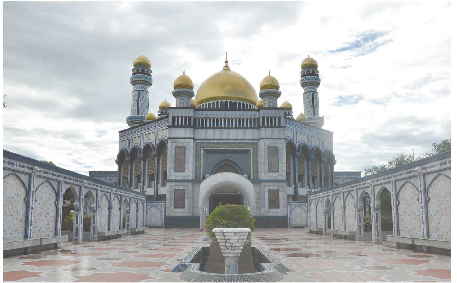
Jame'Asr Hassanil Bolkiah Mosque EMBASSY OF BRUNEI DARUSSALAM

Brunei Darussalam is known as a country rich in oil and gas reserves that have contributed to the country's development over the past decades. As our largest trading partner, Japan is greatly appreciated for its continued support in the energy sector and we remain committed to providing a reliable and stable supply of LNG. Recognizing the impact of global financial uncertainty and a decline in oil and gas prices, the government of Brunei Darussalam has renewed