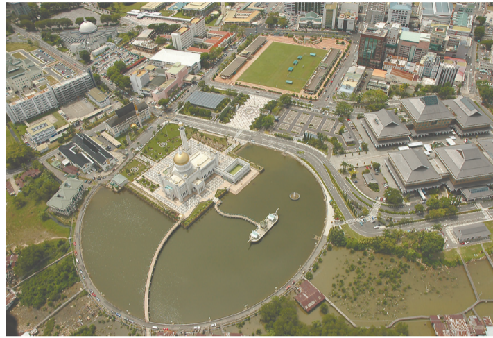
Aerial View of Sultan Omar Ali Saifuddin Mosque EMBASSY OF BRUNEI DARUSSALAM

32nd anniversary of the establishment of diplomatic relations between Brunei Darussalam and Japan and I am certainly pleased to witness