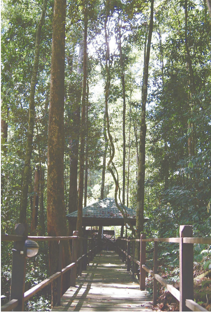
Bukit Shahbandar Forest Recreation Park EMBASSY OF BRUNEI DARUSSALAM