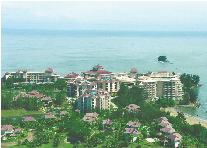
Empire Hotel and Country Club EMBASSY OF BRUNEI DARUSSALAM

Last, but not least, I would like to thank The Japan Times for giving me this opportunity to say a few words and also to the sponsors for their generous support. We look forward to continuing the strong partnership between Brunei Darussalam and Japan and we are confident that our relationship and cooperation will continue well into the future.