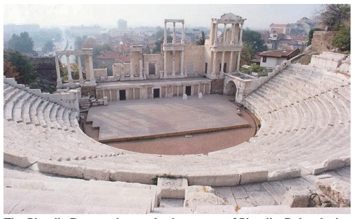
The Plovdiv Roman theater in the center of Plovdiv, Bulgaria, is one of the world's best-preserved ancient theaters. Plovdiv will be the European Capital of Culture in 2019.

Today, there are more than 10 Bulgarian friendship societies all over Japan with two others established during the last year. The two latest additions being the Bulgarian Rose Cultural Association and a branch of the Bulgaria-Japan Friendship Association in Sano, Tochigi Prefecture. Thanks to their