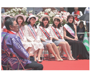
The Fukuyama Rose Festival is held every year in May to celebrate cultural exchange between Fukuyama, Hiroshima Prefecture, and Kazanlak, Bulgaria, which is famous for its Rose Valley and oil-yielding roses. FUKUYAMA

In view of the growing EU-Japan partnership and the high priority of cooperation with Japan in Bulgaria's foreign policy, our efforts are focused on achieving a balanced, regular high-level political dialogue, developing new forms of cooperation in the fields of advanced technologies, science, education, sports and defense, while enhancing bilateral trade and economic relations. We attach particular importance to expanding Bulgarian exports to Japan, attracting direct Japanese investment and increasing the number of Japanese tourists. I take this opportunity to