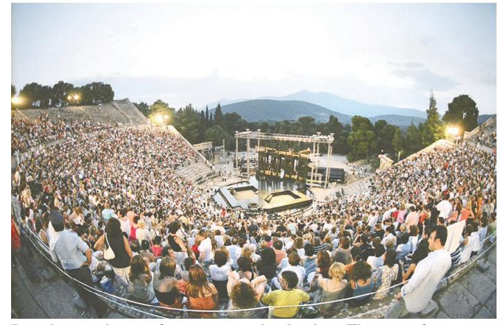
People watch a performance at the Ancient Theatre of Epidaurus.

travel experiences to visitors. Last year, more than 25 million travelers were drawn to the splendor of the Greek islands. making Greece one of the most popular destinations worldwide. With its unique historical and cultural heritage and an abundant natural diversity. Greece offers a wide variety of attractions to explore. Additionally, a rich gastronomic tradition with exquisite flavors from local products provides additional incentive for every visitor.