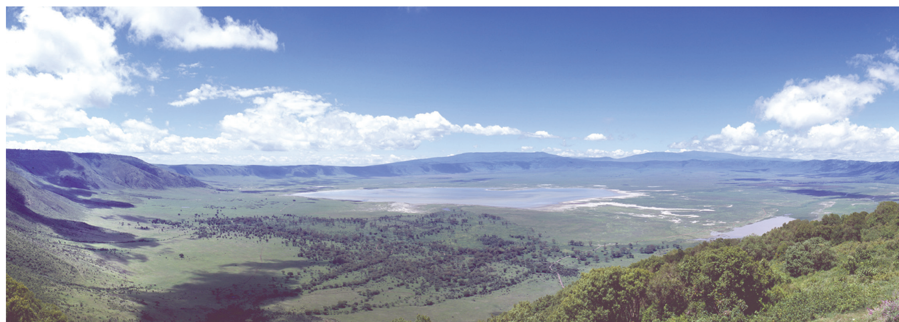
(Clockwise from above) Panoramic view of the Ngorongoro Crater in the Ngorongoro Conservation Area, a UNESCO World Heritage site in northern Tanzania; Beautiful coastline of Zanzibar; Gnu herd in Serengeti National Park, also a UNESCO World Heritage site in northern Tanzania

On the political front, Tanzania continued to enjoy peace and political stability; while democracy continues to take root and basic freedoms, human rights and rule of law continued to be respected and observed. As mentioned above, there was a peaceful transfer of power on the political front in November after successful and transparent elections. This was the nation's