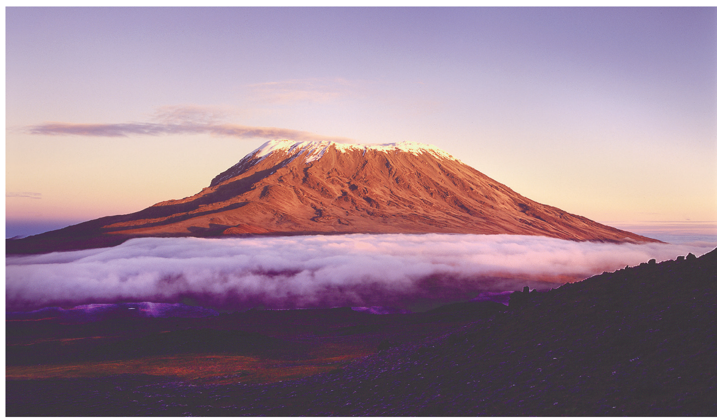
Mount Kilimanjaro is the highest peak in Africa and the tallest free-standing mountain in the world.