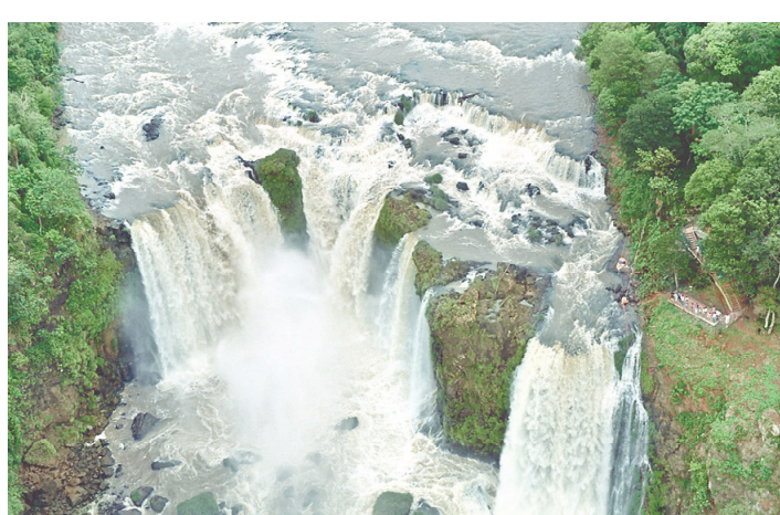
Clockwise from top left: The former congress building now houses a history museum; The Jesuit Missions in Trinidad are a UNESCO World Heritage site; Monday Falls lie close to the border with Brazil and Argentina; The Paraguayan Chaco is very rich in biodiversity and shares part of the Pantanal with Brazil.

builder and three well-known auto parts companies have already established manufactur-