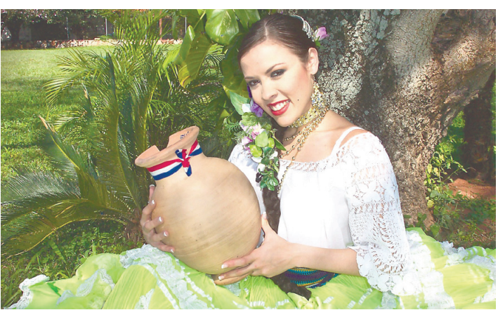
Clockwise from top left: Paraguay is currently the sixth-largest beef exporter in the world; The country is the fourth-largest exporter of soybeans; Paraguayan women are known to be strong and hardworking, given their role in rebuilding the country after the Triple Alliance War; Japanese immigrants and their descendants quickly acquired Paraguayan customs such as drinking terere.