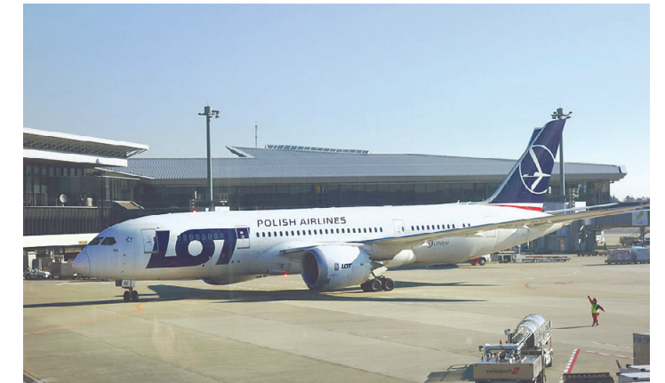
LOT Polish Airlines Boeing 787 Dreamliner EMBASSY OF POLAND

The opening of a direct flight by LOT Polish Airlines between Warsaw and Tokyo in January brought Poland closer to Japan than ever before. I am convinced that this connection will greatly contribute to the enhancement of our bilateral relations.