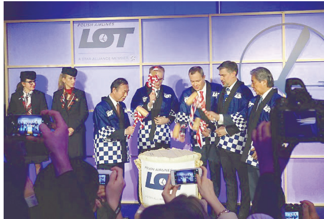
LOT Polish Airlines new route inauguration in Tokyo EMBASSY OF POLAND

New opportunities for boosting bilateral cooperation have also appeared in the energy sector. I wish that a fruitful collaboration with Japan in clean coal technologies would spill over to other related fields. One of them is the so-called hydrogen society in which Japan is the world leader. Poland would like to follow in its footsteps, and, by forging partnership with Japan in this area, create new business opportunities for energy companies in