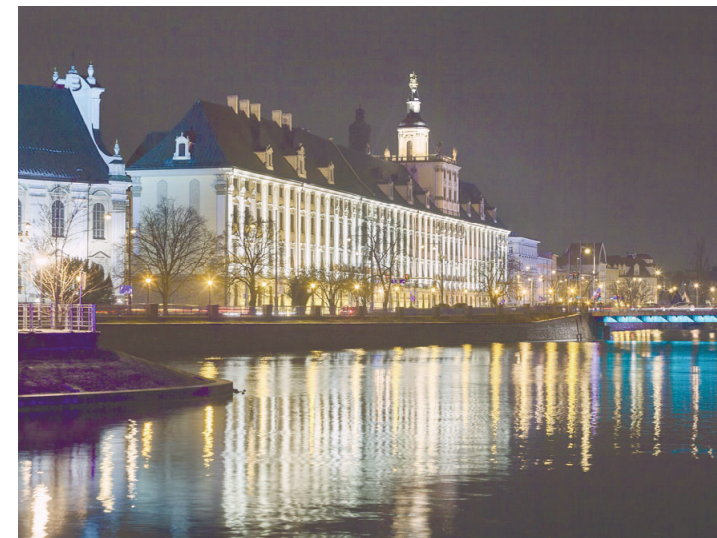
Wroclaw, the European Capital of Culture 2016 MARIUSZ CIESZEWSKI, MFA OF POLAND

Congratulations to the People of the Republic of Poland on Their National Day