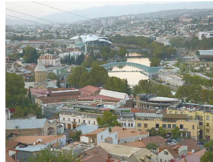
Tbilisi, the capital of Georgia ZURAB TVAURI

Georgia, as a country with an ancient and rich culture, monumental architecture, renowned folk music, colorful dances and hospitality, is increasingly becoming an attractive destination for international visitors. Tourism is a fast-growing sector in Georgia, offering foreign visitors seaside, mountain and alpine