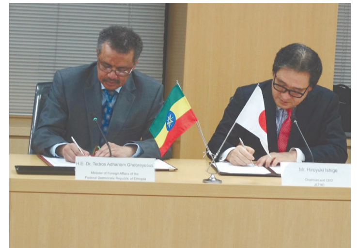
Representatives sign a memorandum of understanding on opening a Japan External Trade Organization (JETRO) office in Addis Ababa. EMBASSY OF ETHIOPIA

This year, the sixth Tokyo International Conference on African development (TICAD VI) will be held in Africa for the first time since the inception of the TICAD process. As we prepare for the summit in Nairobi, our country looks forward to enhancing cooperation with other