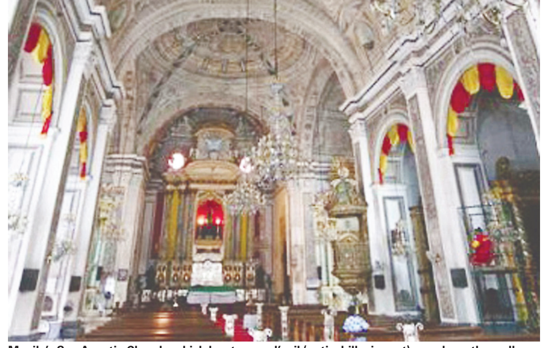
Manila's San Agustin Church, which has trompe l'oeil (optical-illusion art) murals on the walls and ceilings, is designated as a UNESCO World Heritage site.

We hope to further strengthen and deepen the trust and genuine relations that both Japan and the Philippines have continuously cultivated up to this time, as we pursue opportunities presented by this significant