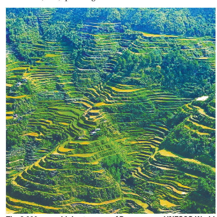
The 2,000-year-old rice terraces of Banaue are a UNESCO World Heritage site.