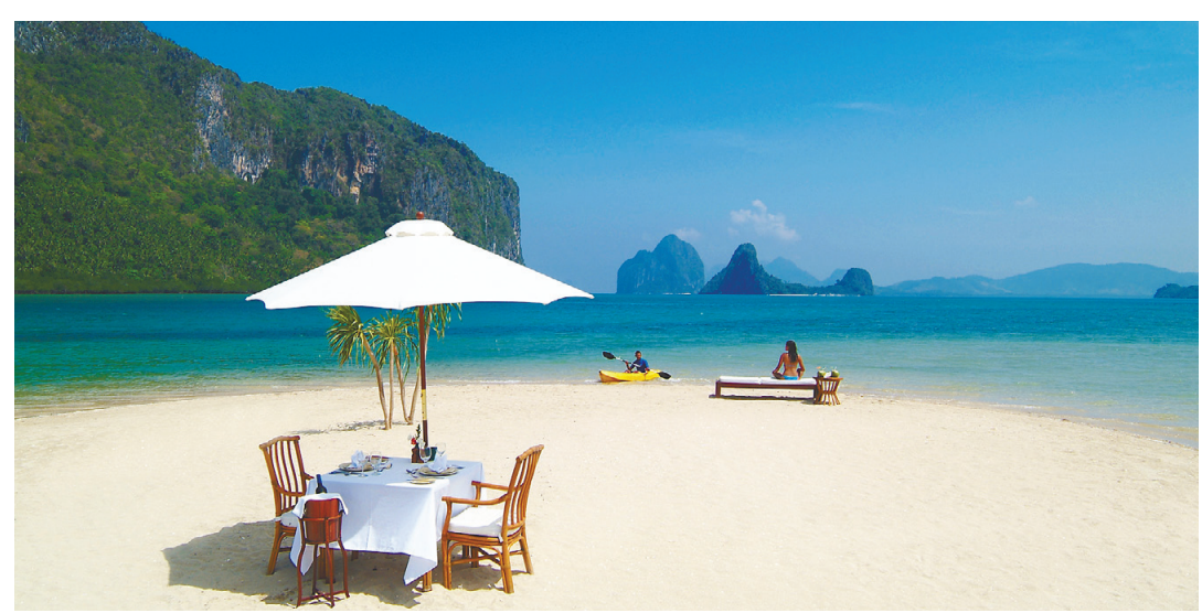
Best in the world: El Nido, Palawan, represents one of the Philippines' countless incomparably

ple in celebrating the abiding strength of Philippine-Japan relations, Asia's closest friendship. Arigatou go-zaimasu, Nihon! Mabuhay!