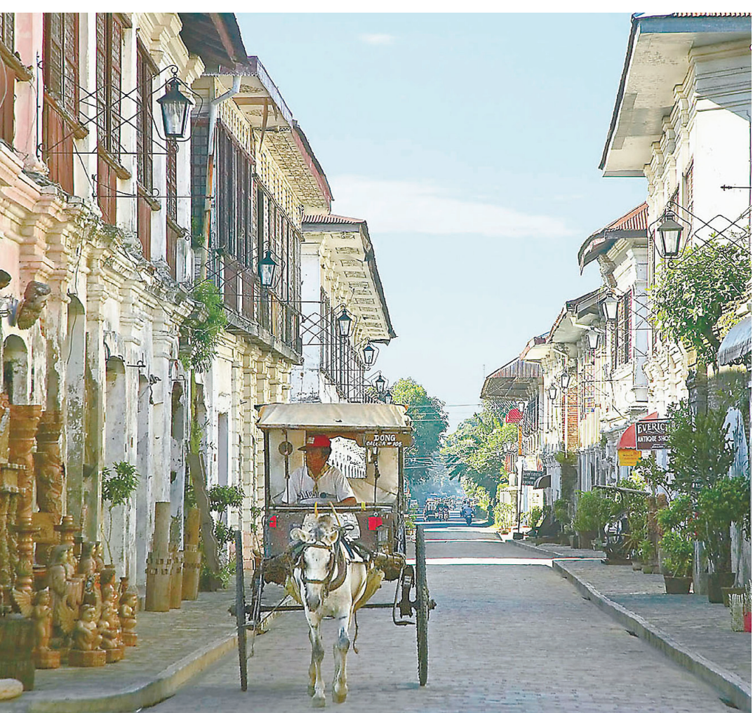
Located on the west coast of the large island of Luzon, the city of Vigan is one of the countries' few remaining Hispanic towns. It is known for its cobblestone streets and unique architecture, earning it designation as a UNESCO World Heritage site.

presently stands in a special spot, with invigorated institutions and rapid economic growth as its bedrock, a new government committed to reform and widespread development as its enabler and a young, educated, and dynamic population as its main supporters. The Philippine business community, likewise, remains committed and active in forging new, and cementing existing, partnerships with our overseas allies. As such, I invite our good friends from Japan to consider the Philippines as a place for business and tourism, and it is my and the Filipino people's fervent hope that you remain our treasured partners in the next chapter of the Phil-