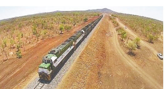
Nacala Railway MITSUI & CO.