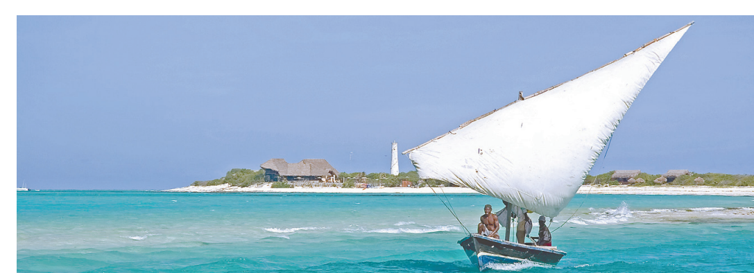
People are able to enjoy a wide variety of marine sports on Mozambique's many beautiful

Another important TICAD initiative that is being implemented in the context of triangular cooperation between Mozambique, Japan and Brazil is the ProSavana, a program designed to transform subsistence farmers into commercial producers through the transfer of agro-technologies. The ProSavana is inspired by the PEDSA