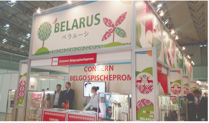
The "FOODEX JAPAN 2016" exhibition in March saw first-time exhibitor Belarus make a strong national showing of more than 40 participants from Belarusian ministries, companies and organizations. EMBASSY OF BELARUS

On the international front, the Republic of Belarus and Japan collaborate within the U.N. and other organizations, including the International Electrotechnical Commission. After Japan organized the international assembly of the com-