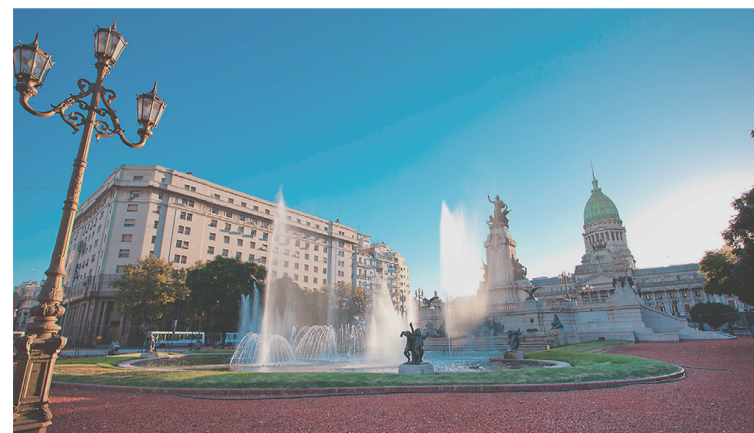
The national Congress building in Buenos Aires INPROTUR

adventure, visiting Iguazu Falls, climbing Fitz Roy peak and the surrounding mountains, trekking the ice cliffs of the Perito Moreno glacier, horseback riding through the colorful mountains in Salta and Jujuy and the northern "quebradas" and "salares," and exploring Tierra del Fuego will leave unique, unforgettable memories. For tourists preferring peaceful enjoyment, the horizontal green ocean of "pampas" along with first-class cultural offerings and heritage, make Argentina and Buenos Aires — with its elegant architecture, its internationally famous gastronomy and legendary nightlife — a premium destination. A gastronomic tour following the "Route of Wine" along the rich vineyards of Mendoza to taste Malbec wine and other varieties to accompany the delicacies of the region will be unforgettable. Beef, the best in the world, is not only a must, but it is also a degustation experience to be repeated over and over again. Argentina and Japan share their enlighten-