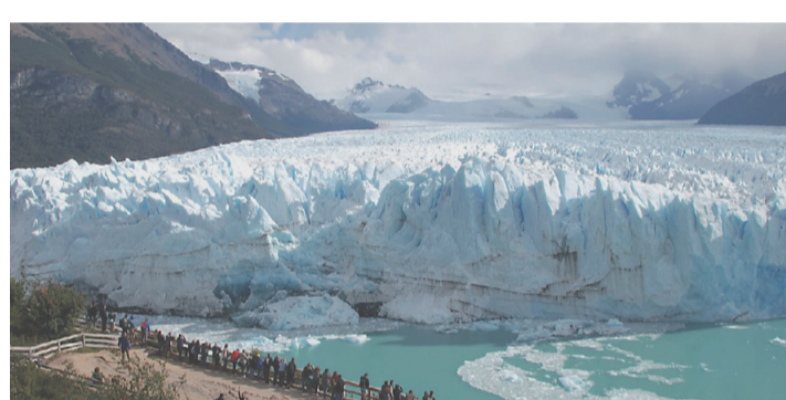
Top: Iguazu Falls in Misiones province; Bottom: Los Glaciares National Park in Santa Cruz province INPROTUR