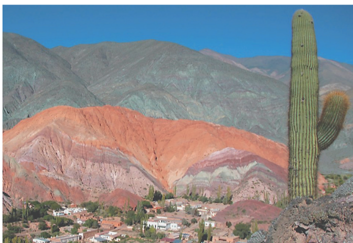
The Hill of the Seven Colors in Jujuy province INPROTUR