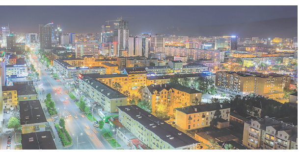
Night view of Ulaan Baator EMBASSY OF MONGOLIA

between Shizuoka, Niigata and Hokkaido prefectures and Mongolia's aimags (provinces). Next year, Mongolia and Japan will celebrate the 45th anniversary of the establish-