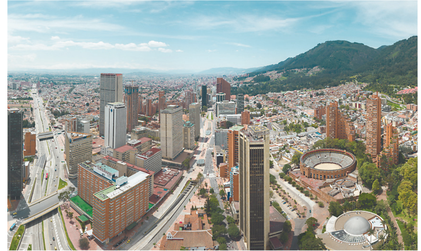
Panoramic view of Bogota, the capital and largest city in Colombia

Please join The Embassy of Colombia in the Commemoration of the Independence Day with Colombian musicians and dancers at Shiba Park in Tokyo on Saturday, July 23, from 11:00 a.m. to 3:00 p.m.