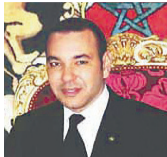
H.M. King Mohammed VI

With the aim of boosting scientific and cultural reflection on Islam and spreading tolerant Islam in Africa, Morocco launched "The Mohammed VI Foundation for African Scholars." The foundation, which is part of Morocco's soft strategy to tackle radicalization and fight extremism and religious fanaticism through the spreading of moderate Islam, is meant to fos-