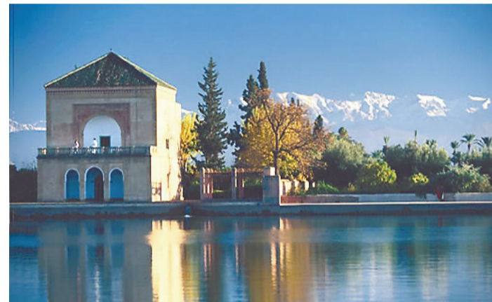
Marrakech is home to the 12th-century Jardin Menara gardens.