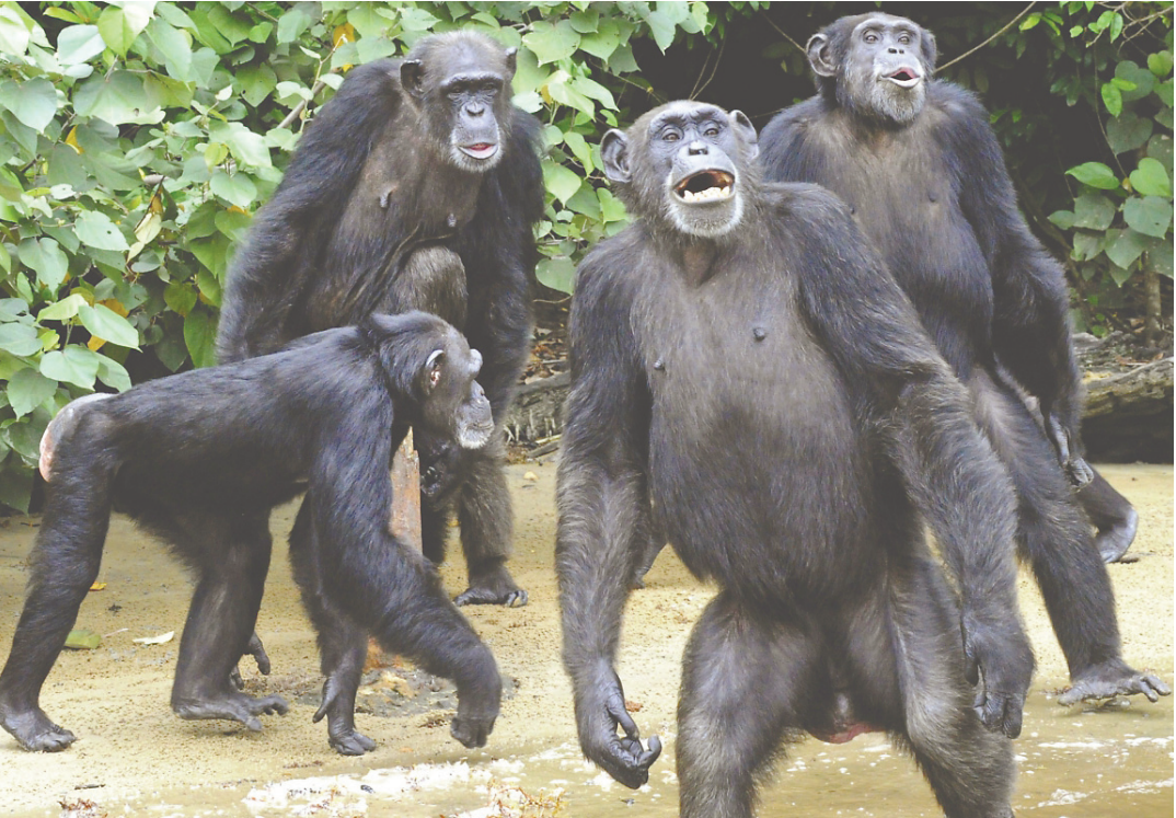
Liberia's Chimpanzee Island EMBASSY OF LIBERIA

God bless Liberia and its people as we celebrate the 169th Anniversary of our Independence.