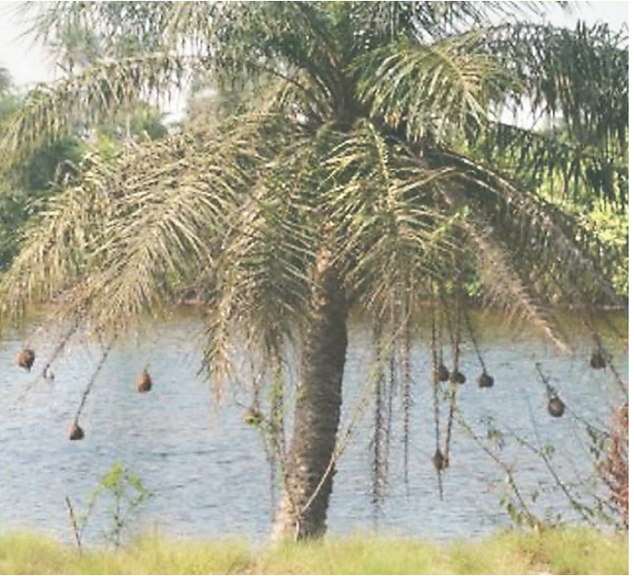
The palm tree, a part of the Liberian coat of arms, is the nation's most versatile source of food and represents prosperity. EMBASSY OF LIBERIA