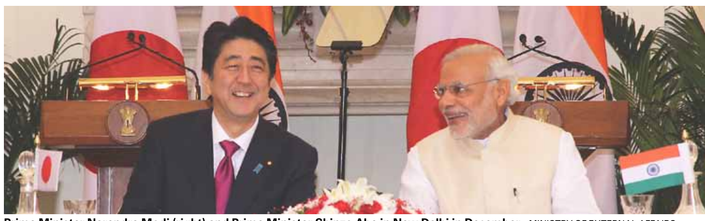
Prime Minister Narendra Modi (right) and Prime Minister Shinzo Abe in New Delhi in December

Keidanren remains committed to holding these activities to further strengthen India-Japan economic relations and we kindly ask for your continued support and cooperation in this endeavor.