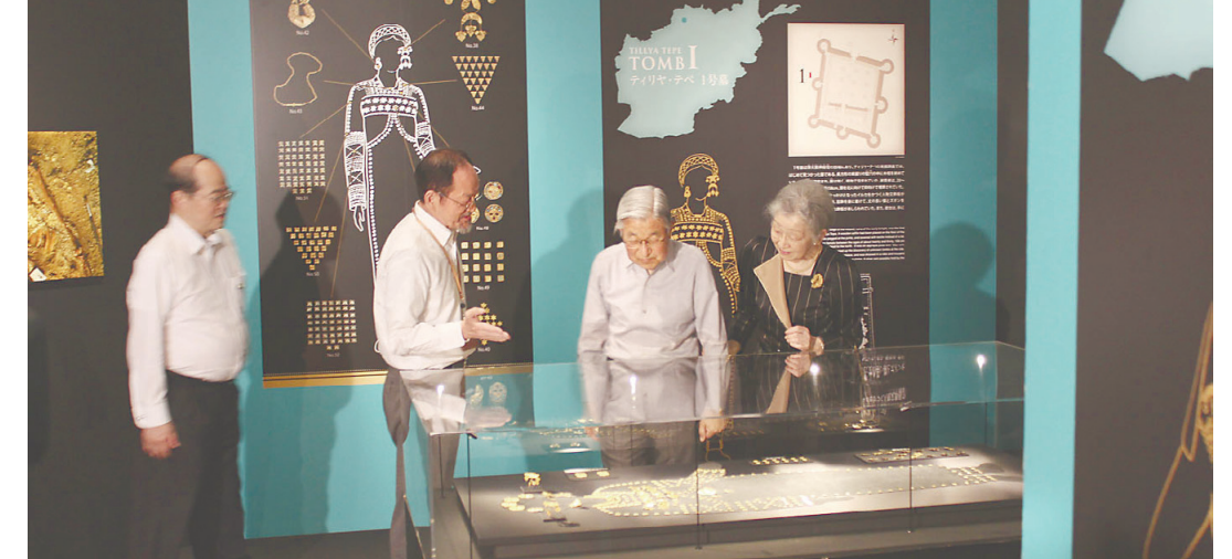
Their Imperial Majesties Emperor Akihito and Empress Michiko at the "Hidden Treasures from the National Museum, Kabul" exhibition at the Tokyo National Museum on June 8. EMBASSY OF