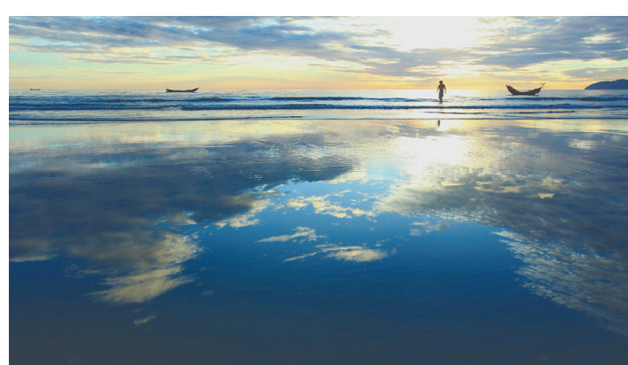
Clockwise from top left: the scenery of Lang Co: Khanh Hoa: Da Nang: and Ha Giang