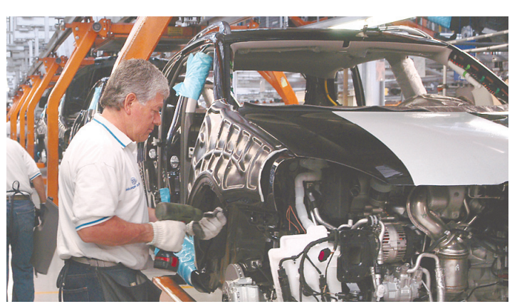
Japanese investment in Mexico has increased dramatically, especially in the automotive industry. MINISTRY OF FOREIGN

emergent countries outside Asia. Since the enactment of the EPA in 2005, Japanese companies have invested more than $21.38 billion in Mexico in several sectors of the economy, including the automotive industry, energy, infrastructure, electronics, metallurgy and agroindustry, among others. In recent years, the number of Japanese companies in Mexico has increased dramatically from 390 at the end of 2009 to the more than 1,000 operating in our country today. To give an idea of the importance of this, until 2014 there were only 11 countries and regions in the world with more than 1,000 Japanese companies (China, the U.S., India, Indonesia, Germany, Thailand, Philippines, Vietnam, Malaysia, Taiwan and the U.K.). Mexico is the first Latin American country to reach that mile-