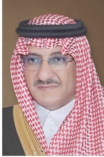
Crown Prince Mohammed bin Naif bin Abdulaziz Al Saud

prehensive construction and industrial renaissance and advanced economic and social services throughout the country. These achievements are eloquent testimony to the effec-