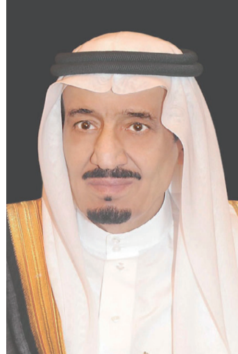
King Salman bin Abdulaziz Al Saud

continued the efforts that have resulted in remarkable achievements and successes. These are reflected in the continued rise of living standards, improvement in the quality of life, com-