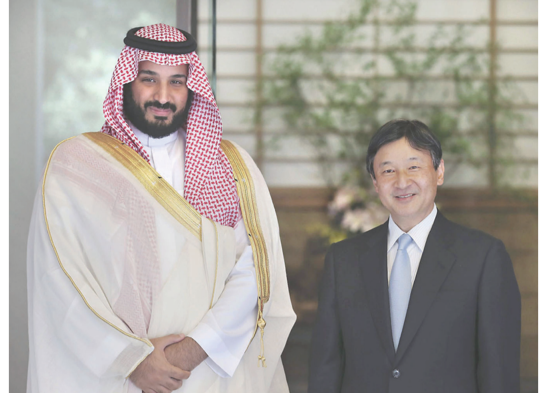
Saudi Arabia's Deputy Crown Prince Mohammed bin Salman bin Abdulaziz Al Saud poses with Japan's Crown Prince Naruhito for a photo in Tokyo on Sept. 2.

More than 60 years have passed since the establishment of diplomatic relations between the Kingdom of Saudi Arabia and Japan, during which time