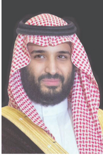
Deputy Crown Prince Mohammed bin Salman bin Abdulaziz Al Saud

The National Day Anniversary of the Kingdom of Saudi Arabia comes at a time when the comprehensive development renaissance, the foundation of which was laid by the kingdom's Founder King Abdulaziz Al Saud, has continued apace during the reigns of his faithful sons and successors down to the present reign of the Custodian of the Two Holy Mosques King Salman bin Abdulaziz Al Saud. Building on the intellectual, institutional and management foundations laid by the founding king, and guided by his ideas and practices in development planning and economic management, his faithful sons have