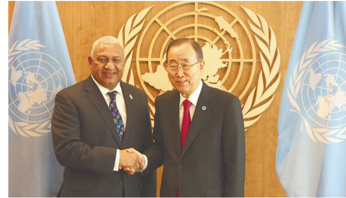
Fiji's Prime Minister Voreqe Bainimarama (left) meets with U.N. Secretary-General Ban Ki-moon at the 71st Session of the U.N. General Assembly in New York in September.

Our nation is a beautiful island of tranquillity amid worldwide upheavals and increased vulnerability to adverse weather events. We have a compassionate and resilient people of many races who have learned to live together over the years despite their differences. We aspire this attribute to continue as we strive to build our nation in every sense of unity and solidarity bilaterally and multilaterally, which is key to