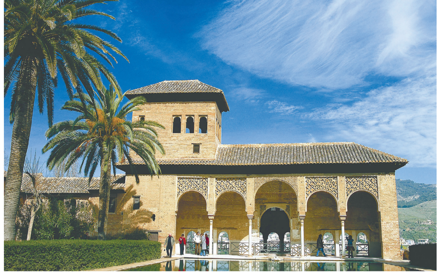
The Damas Tower in the Alhambra, a palace and fortress complex in Granada

I wish to deeply thank The Japan Times for publishing this message and renew our commitment to serve the Spanish community in Japan and the interests of our bilateral relations for the benefit of our nations and our people.