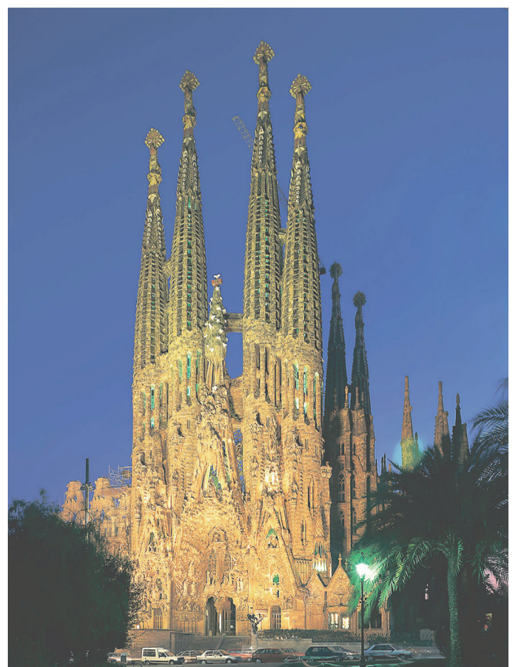
Sagrada Familia, designed by Spanish architect Antoni Gaudi, in Barcelona