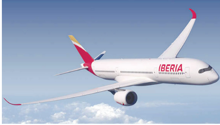
Iberia's new non-stop flight between Tokyo and Madrid will be launched on Oct. 19.

Our bilateral relations have developed enormously in the last 400 years. They are today friendly and cooperative rela-