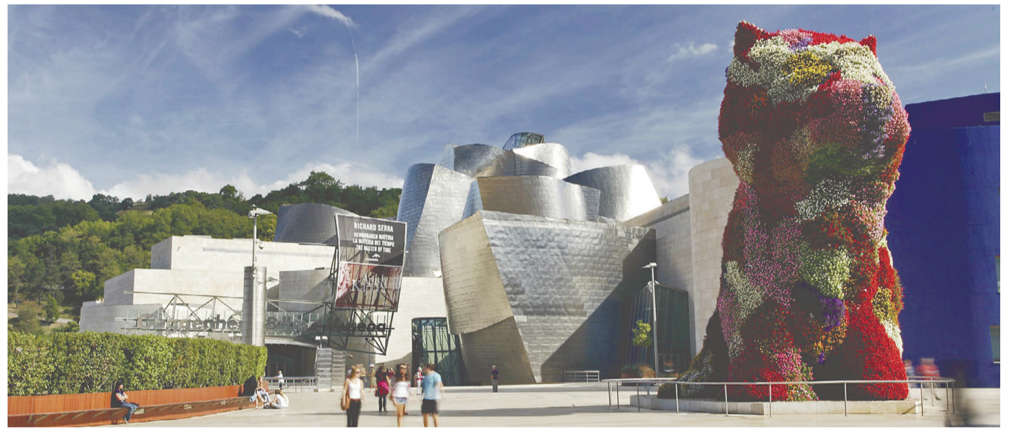
World-renowned Guggenheim Museum Bilbao TURESPANNA