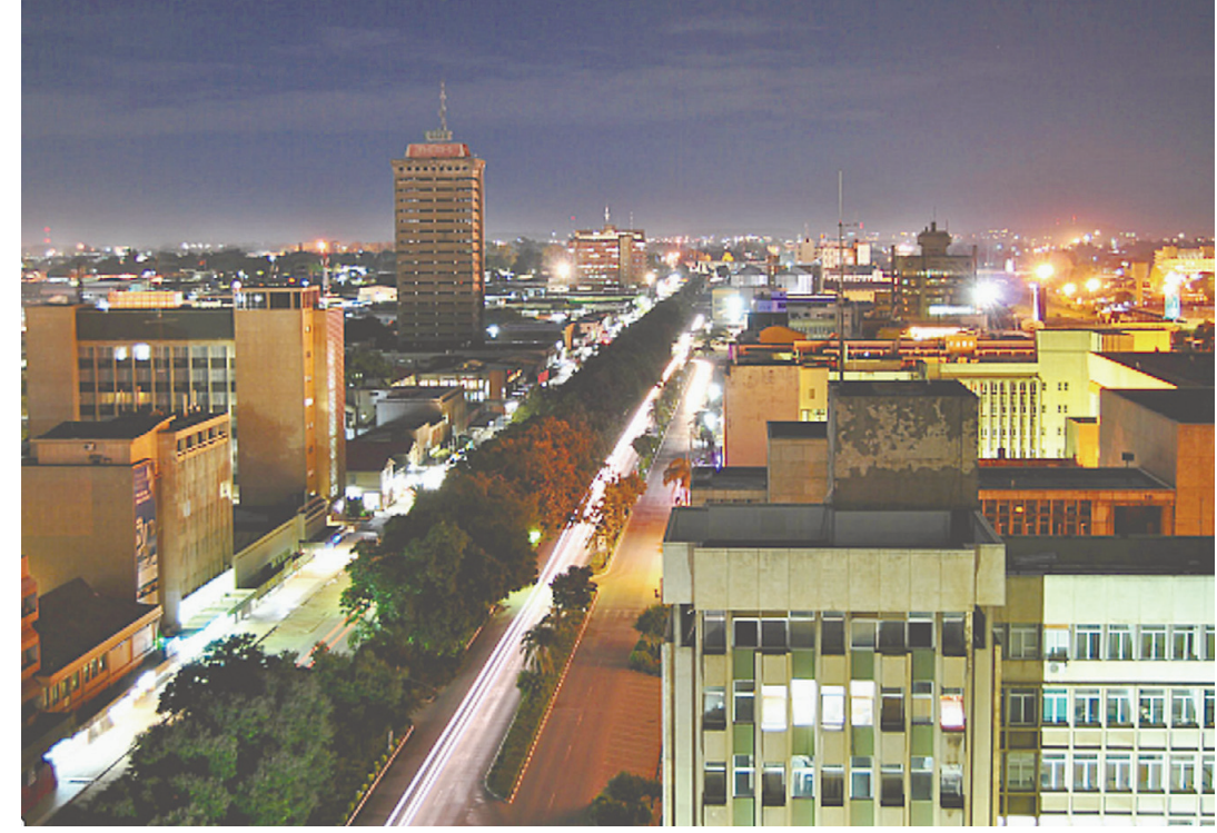
The city of Lusaka's evening skyline

courage future tourists to consider Zambia as a travel destination. The country is home to numerous waterfalls, including Victoria Falls, which is a UNESCO World Heritage site and one of the seven natural wonders of the world. The country is also home to various animals, hot springs and the second-largest wildebeest migration in the world.